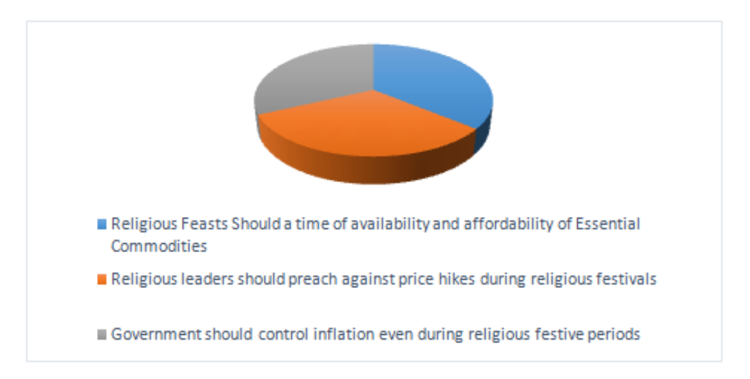
Figure 2 Showing Respondents' Perception on the Ideals of Religious Feasts

Respondents percieved the periods of religious feast as a very good season when all and sundry should showcase love and care. It is not for price hiking and inflicting anxiety on the masses. Thus, both religious leaders and the